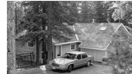
This home's close proximity to combustibles, unrated wood shakes and vinyl siding creates an opportunity for fire to spread easily.